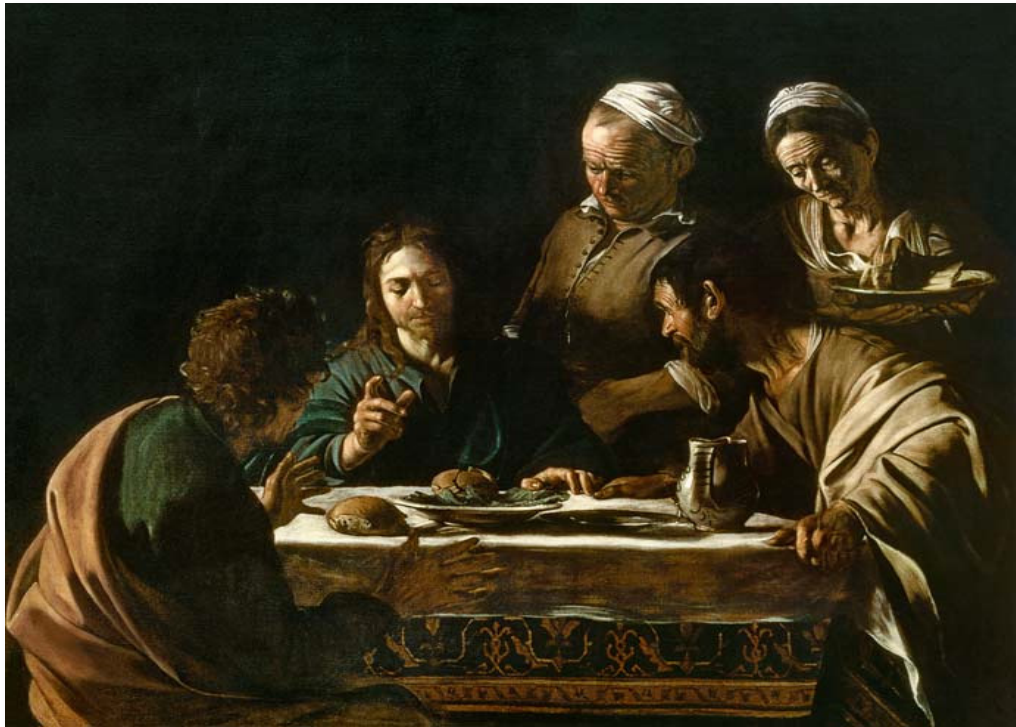
SUPPER AT EMMAUS, 1606 BY MICHELANGELO MERISI DA CARAVAGGIO (1571-1610)