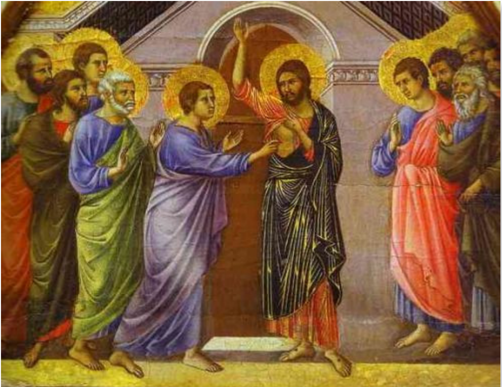
THE MAESTA ALTARPIECE - THE INCREDULITY OF ST. THOMAS DUCCIO. (1308)