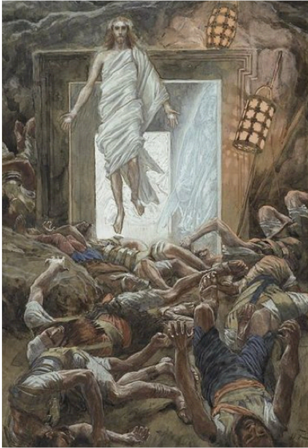
RESURRECTION, BY JAMES JACQUES TISSOT (1836-1902)