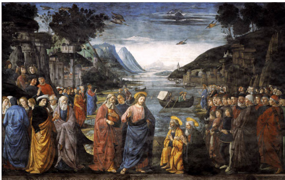
CALLING OF THE APOSTLES: 1481 BY DOMENICO GHIRLANDAIO