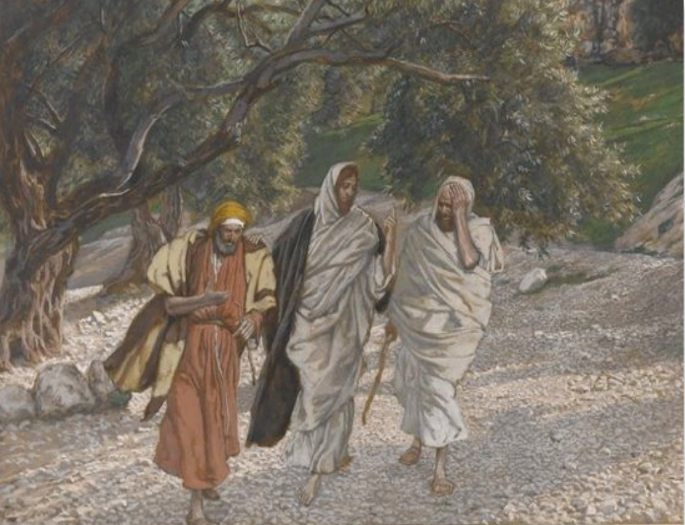
THE ROAD TO EMMAUS BY BY JAMES JACQUES TISSOT