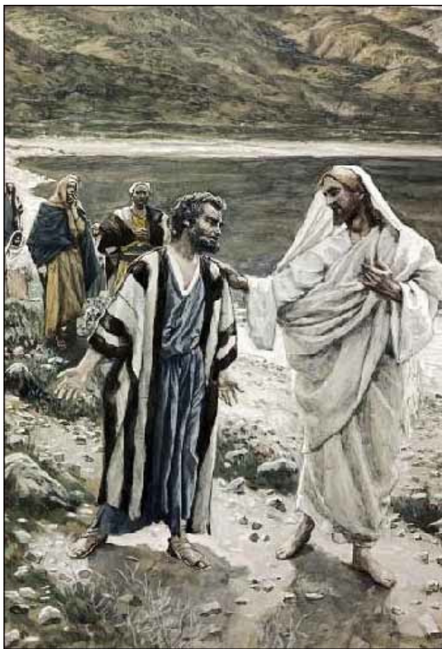
FEED MY LAMB, BY JAMES JACQUES TISSOT