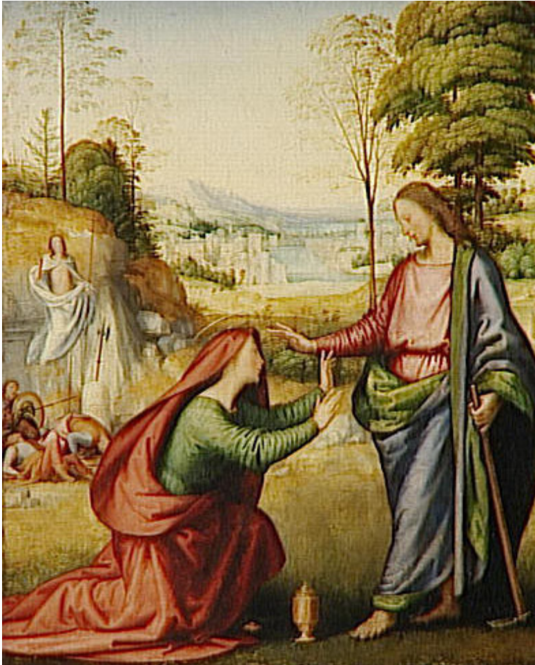
NOLI ME TANGERE BY FRA BARTOLOMMEO (BACCIO DELLA PORTA) (1472-1517)