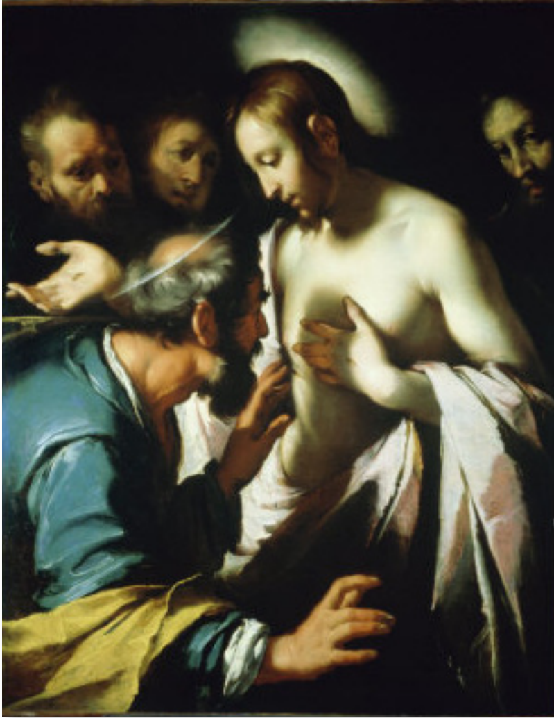
THE INCREDULITY OF THOMAS BY BERRARDO STROZZI (1581-1644)