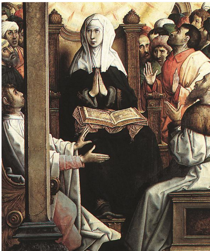
PFINGTEN (PENTECOST) BY JUAN DE FLANDES (1516)