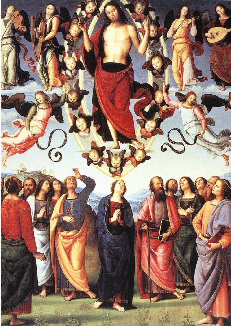
THE ASCENSION OF CHRIST, 1495-98 BY PIETRO PERUGINO (1445-1523)