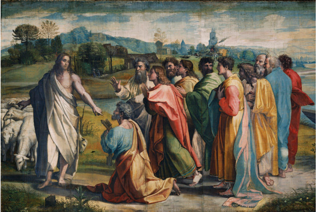
CHRIST'S CHARGE TO PETER, BY RAPHAEL (1515).