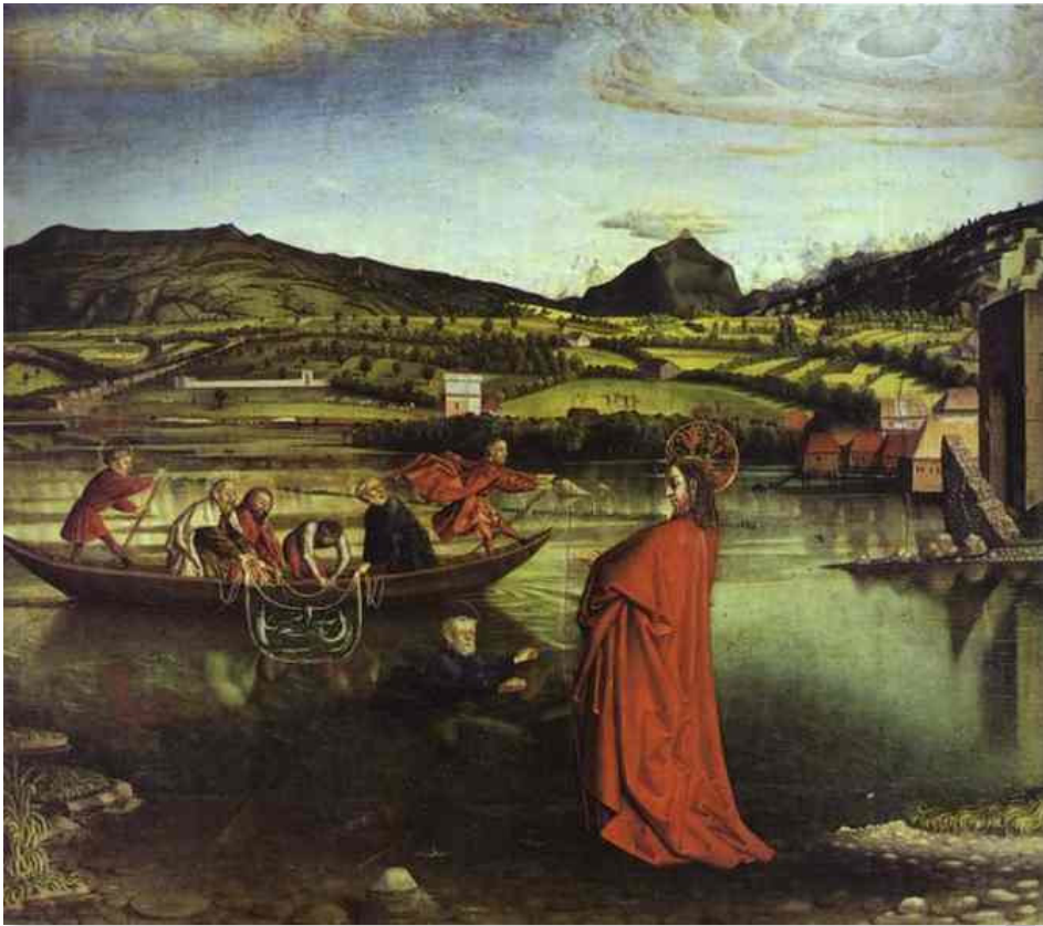
MIRACULOUS DRAUGHT OF FISHES BY KONRAD WITZ (1400-10-44/6)