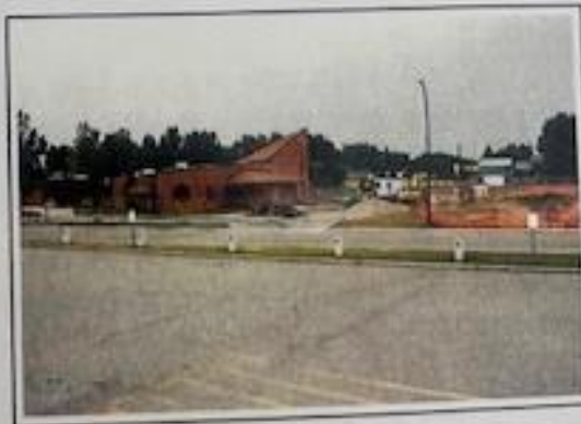
Original St. Bonaventure Church at start of Church expansion.