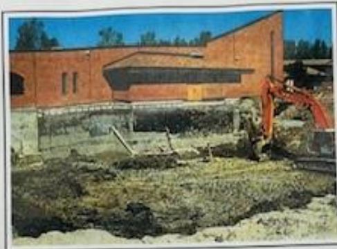
Excavating for the new Parish office and meeting rooms