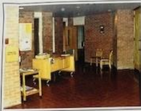
Narthex, information desk and entrance to sacristy in original church.

With great jubilation, the entire Parish celebrated the sod-turning and blessing of the new church site with an outdoor Mass on June 21, 1981. Construction of the new church, at an estimated cost of $1.5 million, was started by Newklas Construction and would take just over one year.