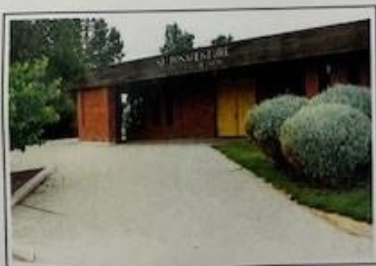
Original entrance to St. Bonaventure Church before 1997 construction