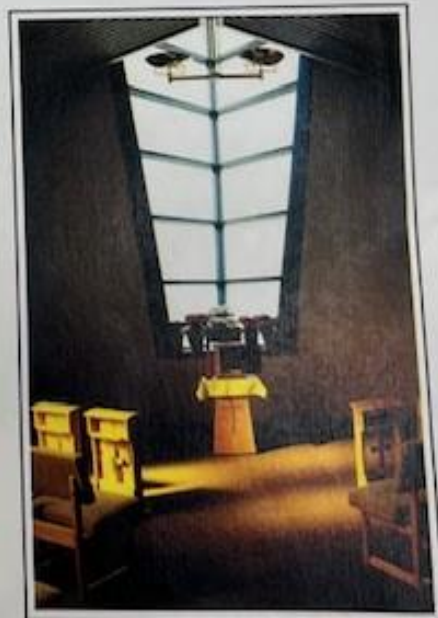
New small chapel