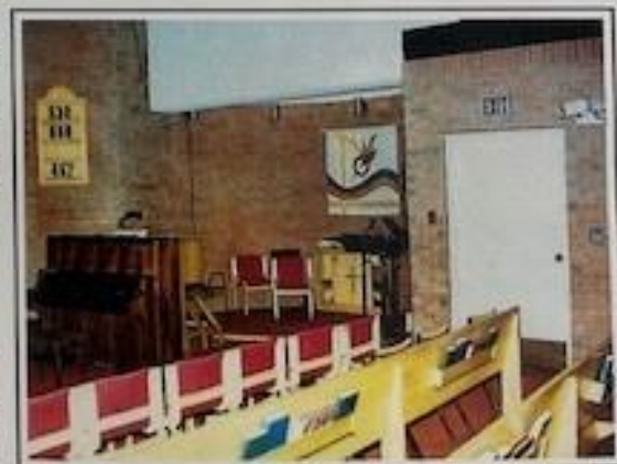
Choir area in original church