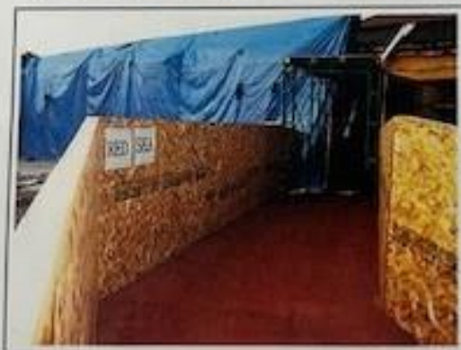
The "Red Sea" temporary walkway into the church during expansion

By 1996 the increased demand for church facilities, meeting rooms, more seating space and a larger narthex, was solved by a major expansion of the church. This expansion began in the spring of 1996, but services continued at the church except for a brief interlude during the summer in which the gym at St. Bonaventure Junior High School was used. The church office and additional meeting rooms were added, with completion in February 1997. Access to the church through the red plywood walkway in the construction area was named the "Red Sea" in memory of Moses who crossed that sea with the Hebrews 4000 years before. Church seating was increased from 660 to 750, and the narthex was expanded to include a baptismal font. A new small chapel was also added, and the crying room and sacristy were both relocated.