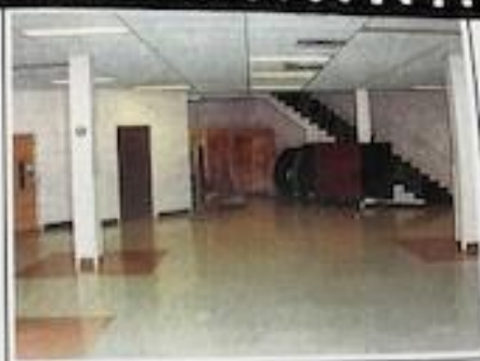
Downstairs Parish Centre in original church before expansion

What does the future hold for our parish? With the creation of the new St. Albert the Great Parish in Mackenzie/Douglasdale, some overcrowding might be relieved. Development of a large unfinished room in the lower level is likely our next major project.